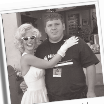
Eddie and Marilyn Monroe at Universal Studios ~ October 2005