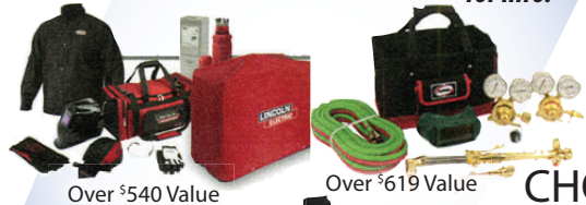
Over $540 Value