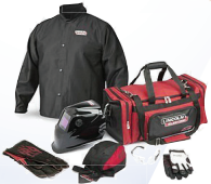
Over $350 Value